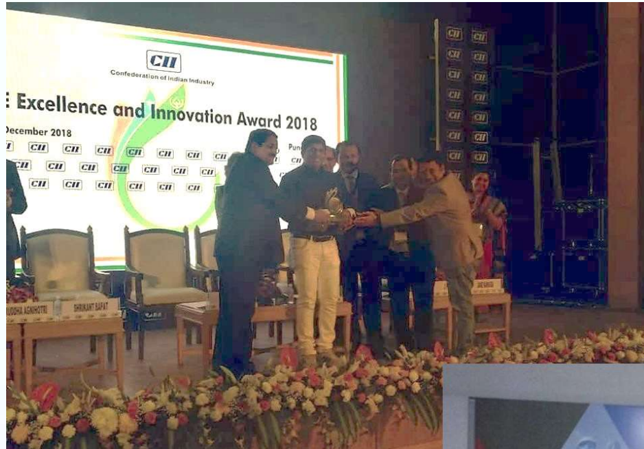
Excellence Award for Safety by CII