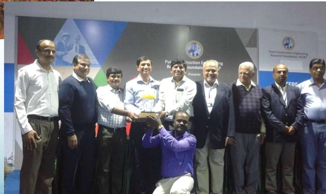
Gold Trophy for Construction Safety by PCERF